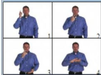
sign for handsome