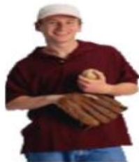
He is a handsome boy.